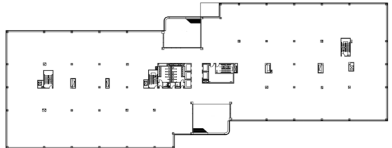
Typical floor plan.

Situated directly off Exit 165 of the Garden State Parkway, Mack-Cali Centre VII provides your company with the convenience of a prime location and the many benefits of a Mack-Cali property.