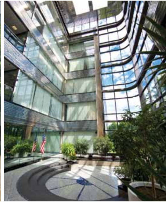
Mack-Cali Centre VII features elegant architectural finishes, full-height skylit atriums, and a serene corporate setting.

A t Mack-Cali Centre VII, your business will find a superior office environment in an unsurpassed location. Situated in the heart of affluent Bergen County, you'll enjoy excellent access to a vast network of highways and numerous nearby amenities. This premier, five-story class A office building also features dramatic full-height skylit atriums, state-of-the-art building systems, an attractive campus-like setting, and more.