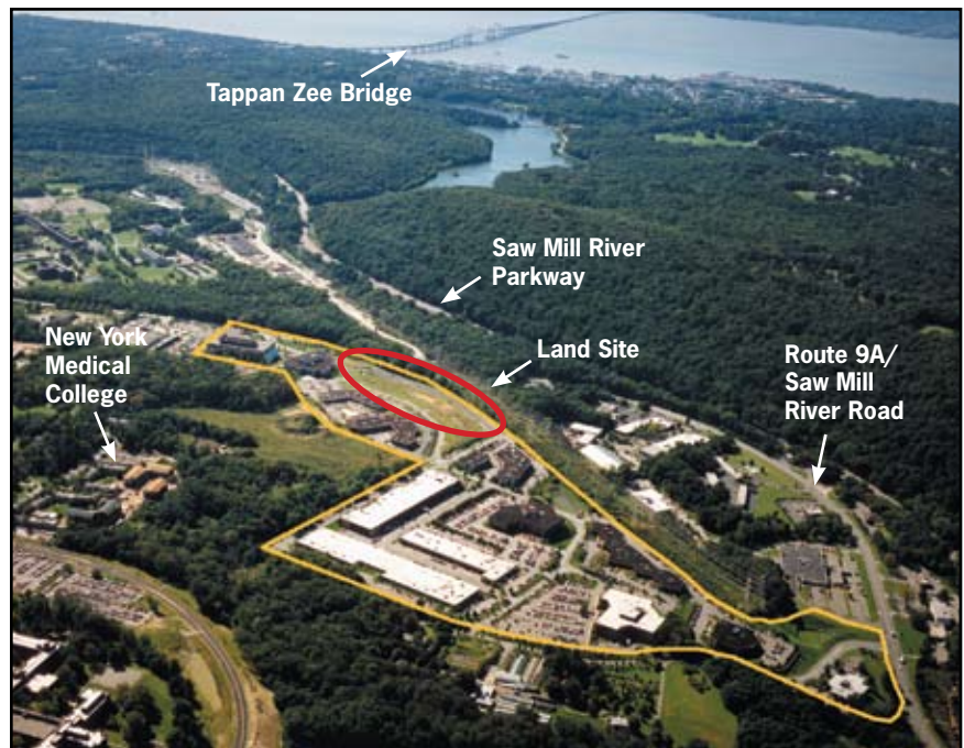
The 75-acre Mid-Westchester Executive Park offers an exceptional business location with buildable land available for tenant expansion opportunities.

New York/Connecticut Regional Office: 100 Clearbrook Road Elmsford, NY 10523