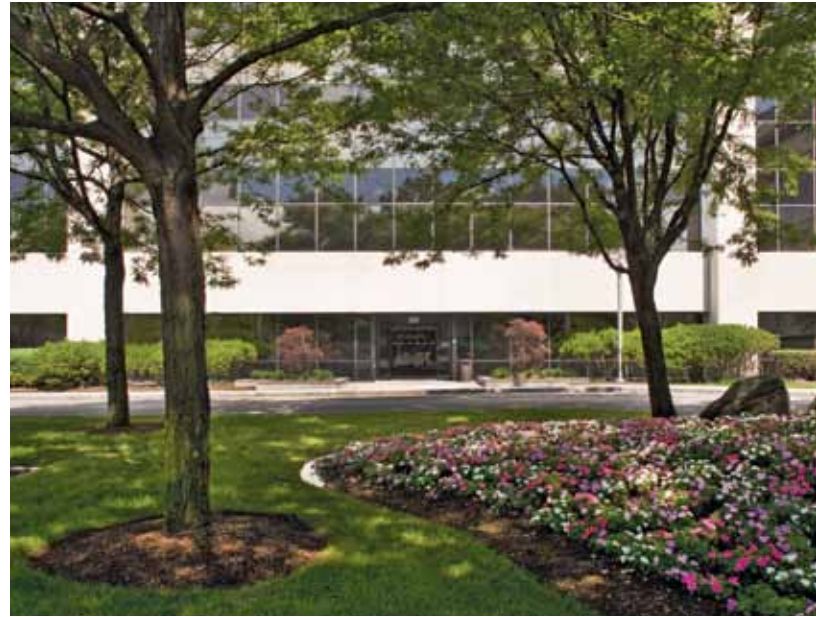
Talleyrand Office Park consists of twin class A office buildings and one restaurant in a beautifully landscaped, wooded site.

Strategically situated on the Tarrytown “Platinum Mile,” Talleyrand Office Park provides easy access to all major area highways, hotels, restaurants, and business services. Its strategic location, advanced building systems, on-site amenities, and extensive surface parking make this Park difficult to pass up.