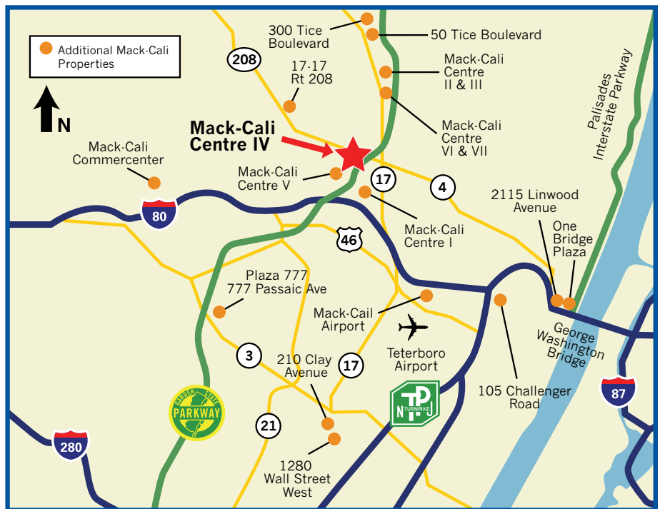
Situated directly off of Exit 160 of the Garden State Parkway, Mack Centre IV provides your company with the convenience of a prime location and the many benefits of a Mack-Cali class A office property.