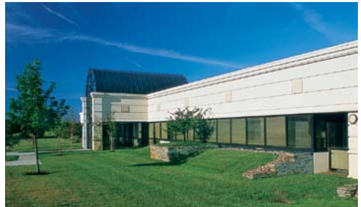
Buildings in the complex offer private entrances and ample parking.

For further information, contact the Mack-Cali Leasing Department at 908.272.8000 or e-mail: leasing@mack-cali.com .